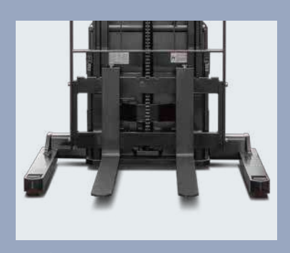
Fixed Straddle Baselegs (Inside Dimension in 4" increments from 38" to 50"); Adjustable baseleg optional to fit a wide range of pallet sizes