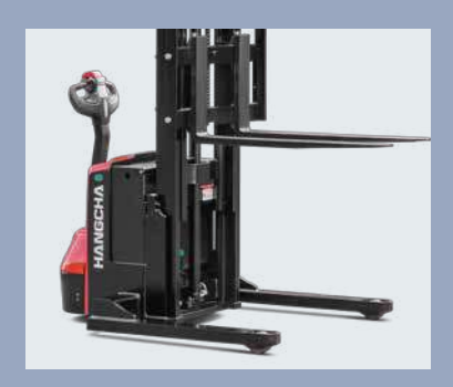
Pump motor controller offers proportiona lowering, it can provide low noise, precise control and stable lower good