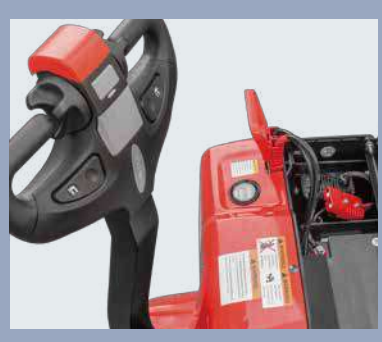
Built-in charger and maintenance free battery