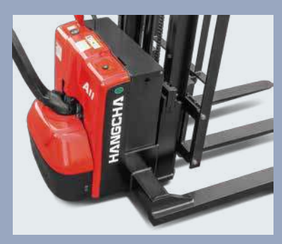
The compact body and big rounded design provide an ideal operation in limited space, and the wedge designed chassis greatly increases the passing ability