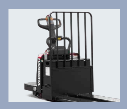
The load backrest is secured with high-strength bolts, which can protect the operator effectively