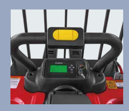
The CURTIS AC control system offers accurate and stable work, and higher efficiency