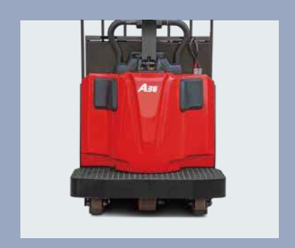
The roomy platform features low steps neights to reduce fatigue, and cushioned ean pads (Opt.) allow the operator to adjust stance throughout the shift, enhancing operator comfort